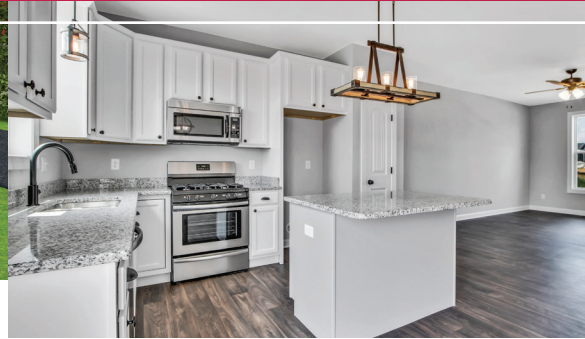
Optional Elevation A